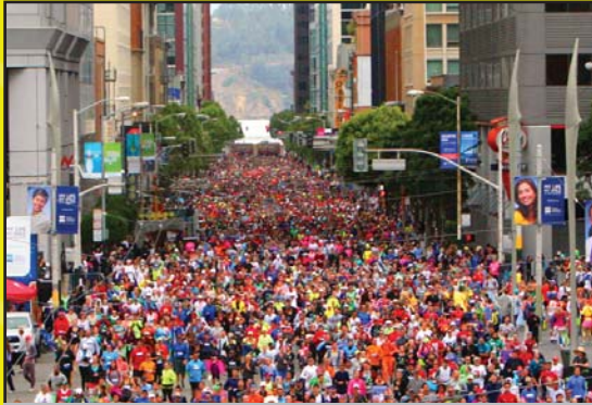
View 2016 Race Highlights [HERE]