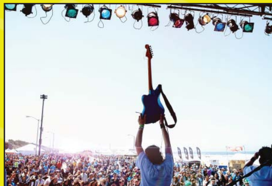
See the Finish Line Festival [HERE]